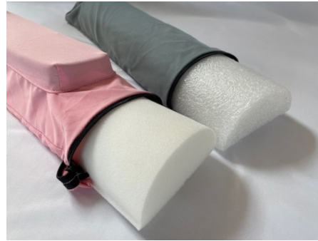
Align foam insert Arch to the shape of insert cover