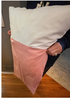
Place your pillow into Pillow-Roo pillowcase