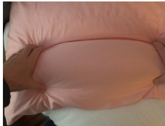
Pillow –Roo pillowcase insert should be placed under pillow with flat side of foam insert against mattress