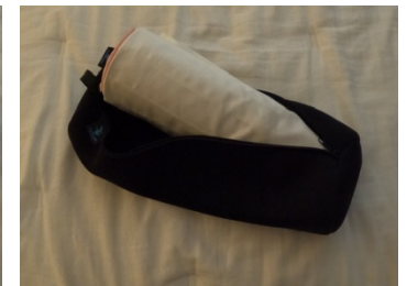
Pillow-Roo Traveling Case option